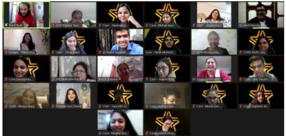
Participation in Talent Parade