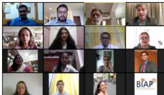
Orientations organised for the first-year students

The Students' Council also organised the Orientation for the first-year students of Junior & Degree College on July 30, 2020 & October 12, 2020 respectively. The trustees of the HSNC Board and Provost of HSNC University along with the I/C Principal and Vice Principals gave encouraging and motivating guidance to the students.