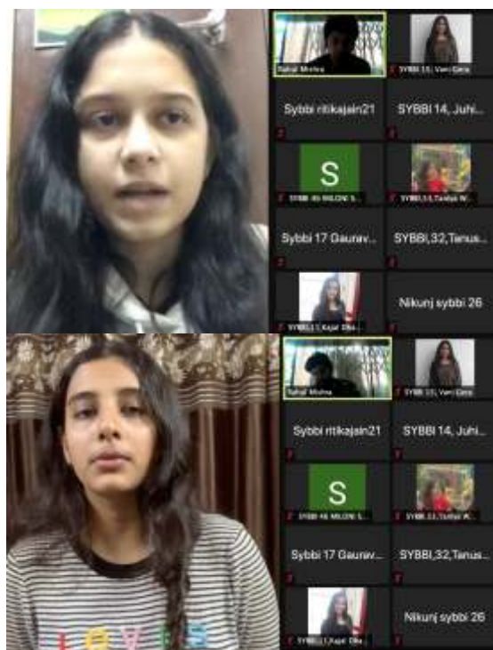
Anti ragging campaign

The Anti-ragging Campaign was held on wherein the necessary information and preventive measures were spoken out in a video , which was shown in the zoom lectures. There were posts on social media as well.