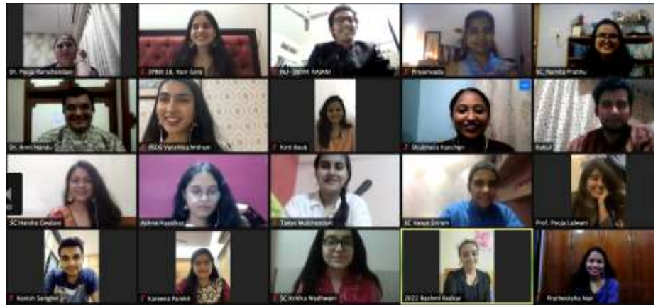
Soiree of Lights