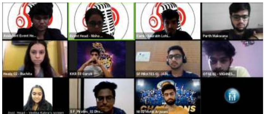
Participation in Sports Fiesta