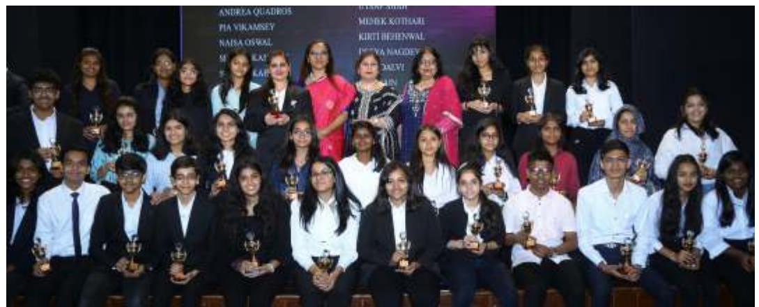
Annual Prize Distribution 2022-2023