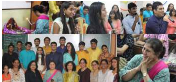
December 16, 2022 - Hasya Kavi Samellan - The event then witnessed marvelous and superb performances consisting of recitation of poems, teacher's participation, group dances and much more.

HSP aims to promote not only our national language Hindi but also Indian ethics, values and culture amongst the students by organising various activities like essay writing competition, debates and cultural events like Independence Day and Guru Purnima etc. It provides a platform for its students to participate and organize events like Essay and Dance Competitions.