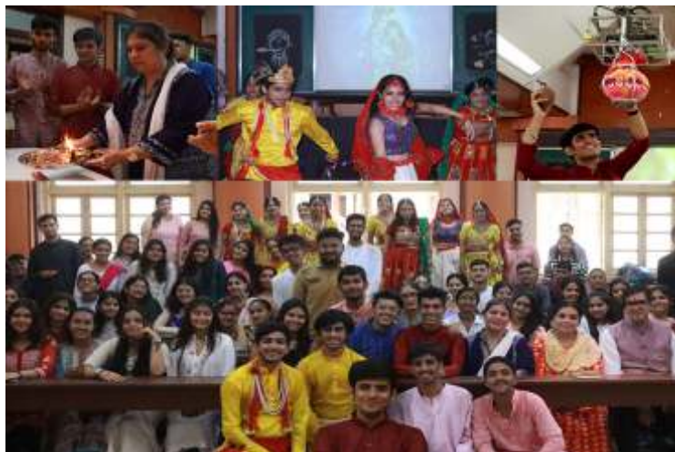
August 17, 2022 - Janmashtami Celebration at H.R. College