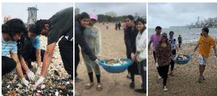
Volunteers picking, collecting and carrying a basket of waste to be disposed