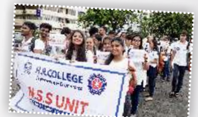
Rally to spread awareness about Organ Donation .