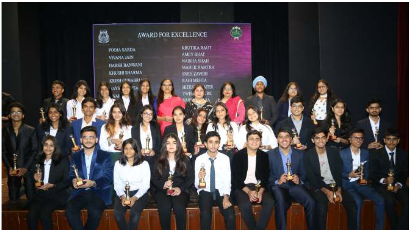
Principal with her Brand Ambassadors

At our College, the highly motivated faculty works very hard to prepare the student for the changing global environment. We offer students tons of opportunities for experiential learning through clubs, student government, internships, hands-on learning and various other forms. Enterprise is another key thrust area of the college where academic-industry interaction enhances the teaching-learning process. The college has entered into several innovative partnerships with global Universities I look forward to working with all of you and stretching you to reach your maximum potential. Enjoy this academic year and all the excitement it will bring!