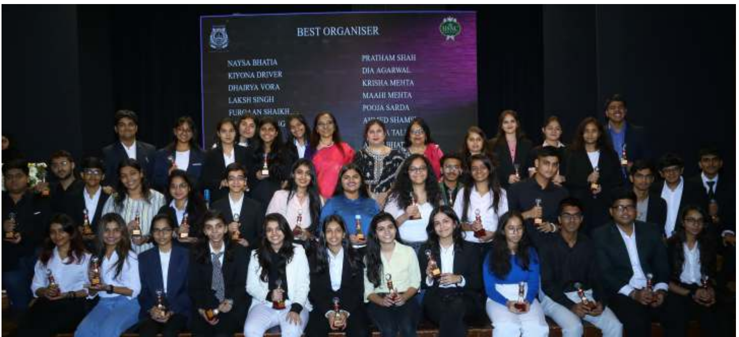
Best Organiser - Annual Prize Distribution Ceremony 2022-2023