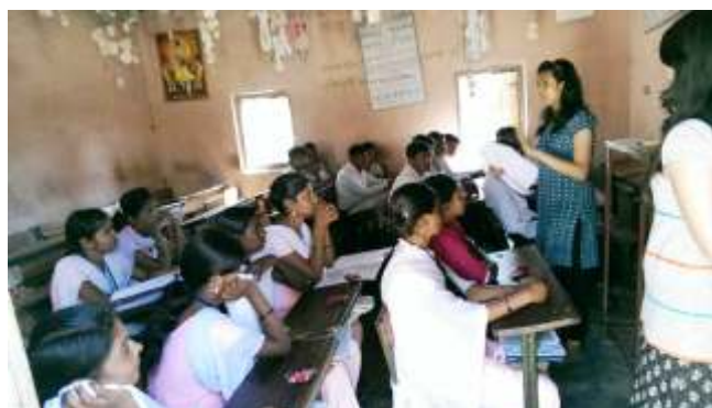
GAZAB MAHARASHTRA - A 7 day program me where members go to a rural college to teach entrepreneurial and business skills, in turn fund a new business idea of a student.

The Rotaract Club falls under the Rotaract district 3140 of Mumbai. It has organised over 500 projects during the year like Boond, Gazab Maharashtra etc.