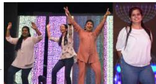
Non-Teaching Staff Dance performance