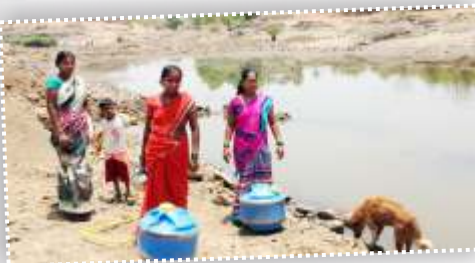
Project Jalvruddhi - introduction of the water wheel to improve accessibility of water in rural areas