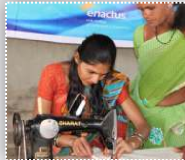
Project Aajeevika capitalises on indigenous skills of the rural women in an attempt to improve their livelihood. The women stitch canvas tote bags which are available in varied trendy designs.