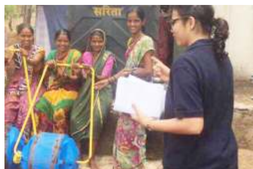
Accessibility to water in rural areas has improved with the introduction of the water wheel

Recently the project was expanded to Shegaon, located at the frontier of Maharashtra. To be able to provide the water wheel at a feasible price, a cross subsidy model was devised by engaging another set of rural women in a revenue-generating process. The profits of which are then used to subsidise the packages.