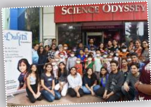
Project Muskaan - bringing a smile to faces of kids fighting cancer.