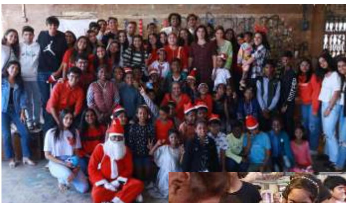
Christmas Party for the students of Foster Care Group, Worked by G.E.M.S.

GEMS Bazaar is an annual event where students put up stalls to develop entrepreneurship skills. CHASE is similar to a treasure hunt. Christmas is celebrated each year with underprivileged members of the society.