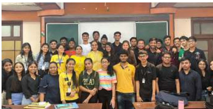
September 29, 2022 - Mind Blob - A team building activity

Mathematrix an inter-collegiate mathematics competition hosted by R.A. Podar College of Commerce & Economics, consisted of various events where students required unprecedented zeal and mathematical skills in order to win. Students secured first position at R.A. Podar's Mathematrix 2022.