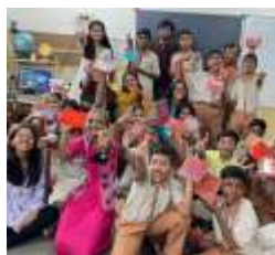
November 19, 2022 UTSAV - Bhavishyan Yaan Kids with their fluid art canvas