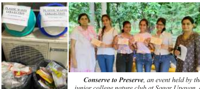
Plastic Waste Management

Nature Nurturers is the junior college nature club. We at Nature Nurturers aim to nurture Mother Earth with all love and care with community participation. The club has been formed with a vision to unite HRites with Nature. Club Nature Nurturers conducts various nature-related fun as well as down-to-earth activities as our duties.