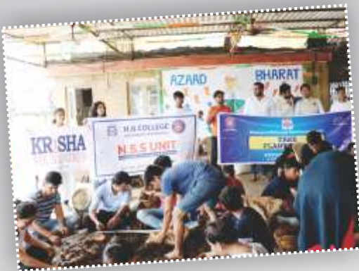
Students prepare seed bombs for the Seed Bombing Project .