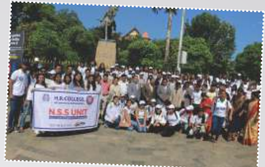
Campaign on Wheels to create awareness of child rights and to reduce child abuse.