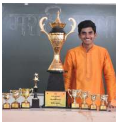
Intercollegiate win - MVM - My Marathi

The objective of the Special Cell is to provide students a support in overcoming dyslexic, learning and other learning deficiencies. The Cell creates a platform for these young adults to prove their mettle and creates a marked difference to their lives.