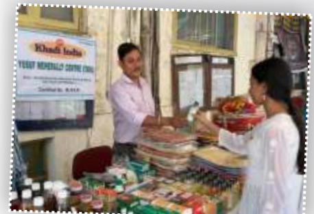
An exhibition-cum-sale held of products manufactured by Yusuf Meherally Centre .