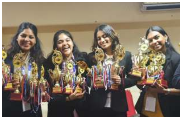
H.R. College won overall 2 nd Runner up place at 3 rd International Economics Convention held at R.D. National College, Bandra.

The Teaching & Learning Materials Centre (TLMC) is a curriculum laboratory which provides resources aimed at improving the teaching and learning process. The TLMC has activity guides, simulation games, instructors manuals, examination guides, cassettes, slides, curriculum guides, multimedia kits, video discs etc.