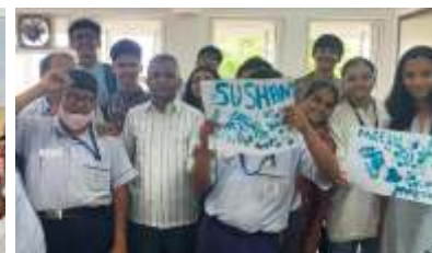
September 23, 2022 - SPARKLES Autistic kids created piece of artwork