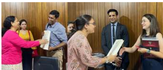
July 25, 2022 - University of Bristol Visit

The college has secured several opportunities for meritorious students to experience alternate learning styles in different cultures and broaden the horizons of their knowledge. Some of the preferred ones are Kedge Business School's Scholarship; Asia Pacific University Japan's Scholarship; Betty and Donald Keating Scholarship to St. Catherine's College, Oxford University, UK; Advance Student Admission Program to the SP Jain Institute for Management and Research, Dubai, UAE; and McDonald Conference for Leaders of Character at the United States Military Academy, WestPoint, USA.