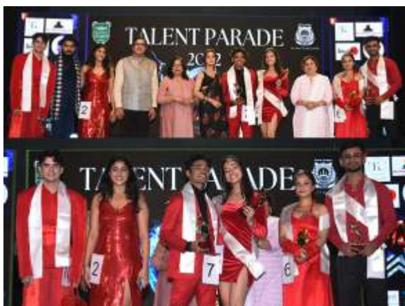
Winners of Superbly choreographed fashion show