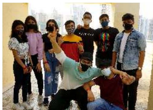
The Chase - an ice breaking session

The PSDC is a unique club set up in H.R. College by its students. It provides a platform to its members where the club grants them various opportunities to learn and polish their skills. The club, along with working on upskilling its members in their individual lives, will also equip them