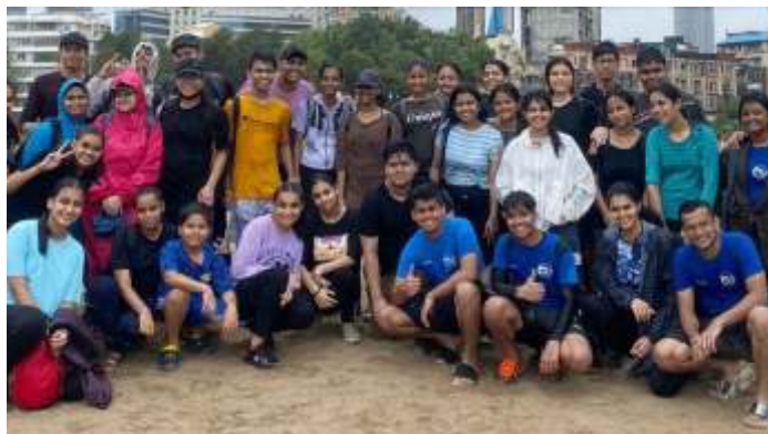
August 7, 2022 - Beach Cleanup - On the occasion of Friendship Day, the Cascade Club of H.R. College collaborated with the Change is Us organisation to befriend the environment

The College regularly organizes Competitions, spanning a variety of activities : Rakhi-Making, Card-Making, Mehendi, Rangoli Nail Art and Tattoo - Making, Poster-Making and Calligraphy. The club organises H.R. Bash which includes Twins Day, Indo - Western Day and Traditional Day.