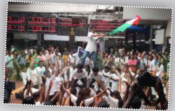
Tryst With Destiny - Flash mob at Railway Station an Independence Day campaign.