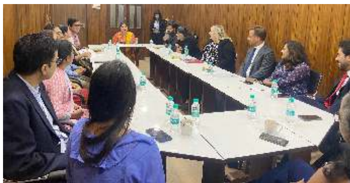
September 22, 2022 - Networking With International Delegates

The constant aim is to expand the scope of activities, to further strengthen the culture of internationalization, start on-campus foreign language courses and build relationships with new universities while maintaining existing relationships, for a mutual exchange of ideas, knowledge, and information.