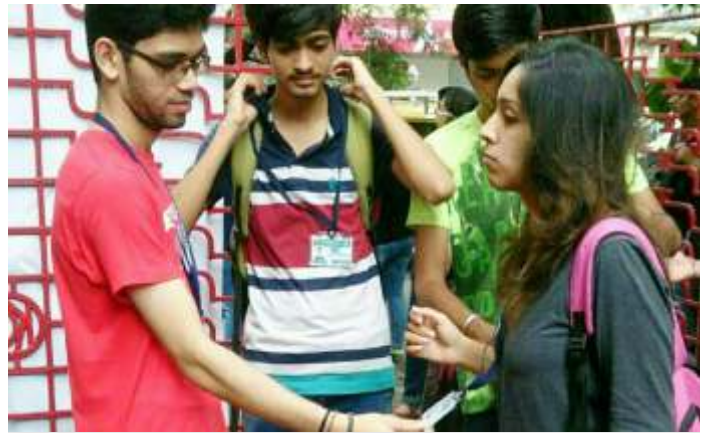
Volunteers check student ID's on the college premises

orientation, appearance, nationality, regional origins, linguistic identity, place of birth, place of residence or economic background.