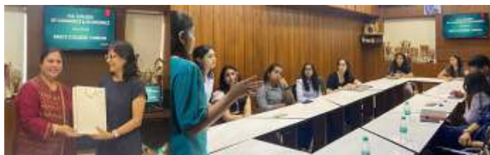
September 20, 2022 - H.R. College X King's College, London