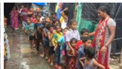
Members of the club have fed a million people by distributing packs of nutritious food at railway stations and in slum areas under LUNCHBOX .