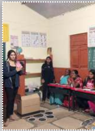
Sanitation - Teaching village women the basics of menstrual hygiene.