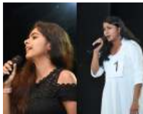
Mesmerizing singing performance