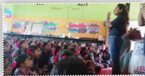
Seminar on Menstrual Hygiene in the municipal school at Gorhe village, Palghar.

10. DEPT OF LIFELONG LEARNING AND EXTENSION