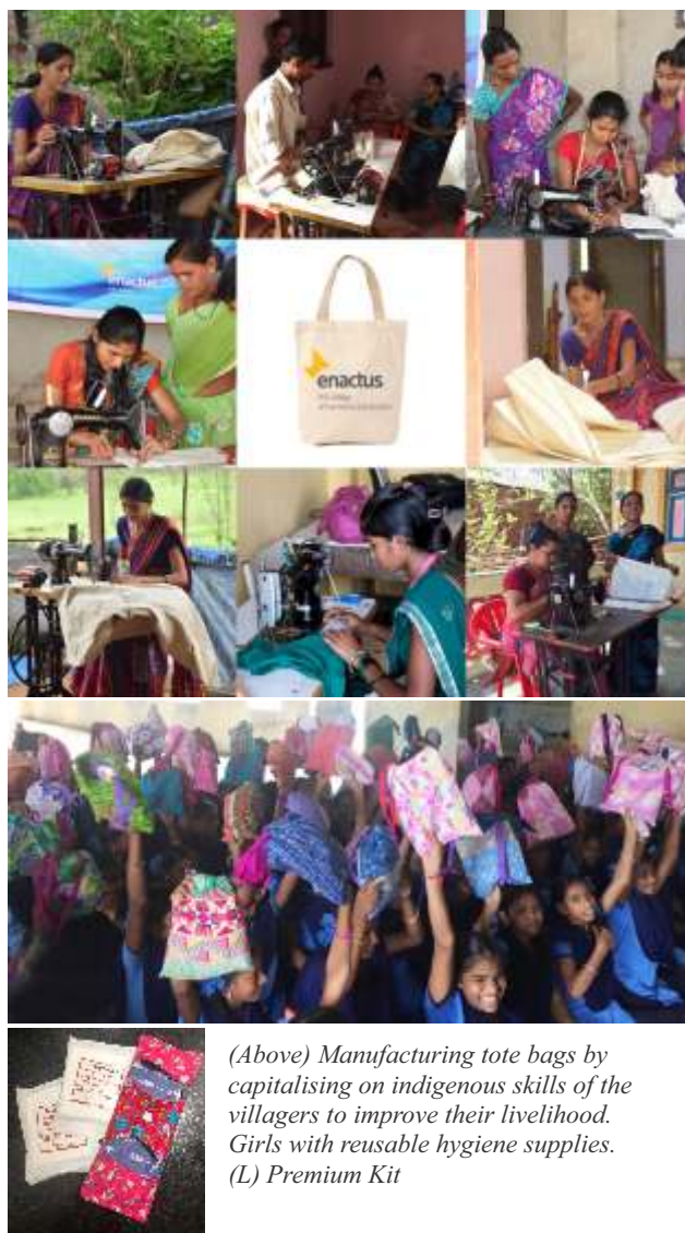
(Above) Manufacturing tote bags by capitalising on indigenous skills of the villagers to improve their livelihood. Girls with reusable hygiene supplies. (L) Premium Kit

and henceforth, enhancing their standard of living. Rural women are empowered to capitalize on their stitching skills. The women possessing stitching skills are identified from rural communities. The women employed are then vocationally trained in being seamstresses. This gives them a skill with which they can earn a livelihood and become independent. Unlike any other competitors, the bags are customizable with zips, chains, and other accessories along with an array of designs at the choice of our consumers. To date, 2,000 bags have been sold under Project Aajeevika