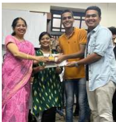
Intercollegiate win - MVM - Hruturang