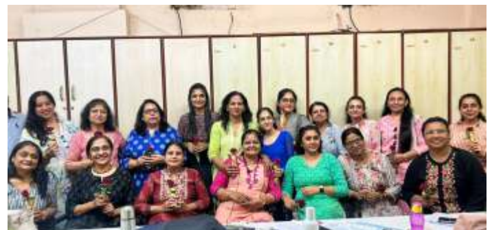
Epsilon Club celebrated Women’s Day on March 8th, 2023 by showing appreciation for the female teachers of the college, which helped to create a sense of community and respect within the college community.

He will be representing India at the world championships.