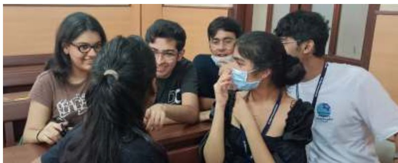
BAMBOOZLED: A themed treasure hunt and quiz

One of the major functions of the council is to work alongside the teaching faculty and ensure co-ordination and integration of all college activities. These would include administrative activities, hospitality of guests and dignitaries, assistance to teachers and staff, participation in inter-collegiate events, student grievances and various extra-curricular activities including social projects.