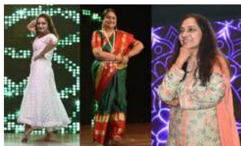
Teaching Staff Dance performance

The fashion show is the grand finale which is eagerly awaited every year as Mr. and Ms. HR are chosen from a very large number of participants.