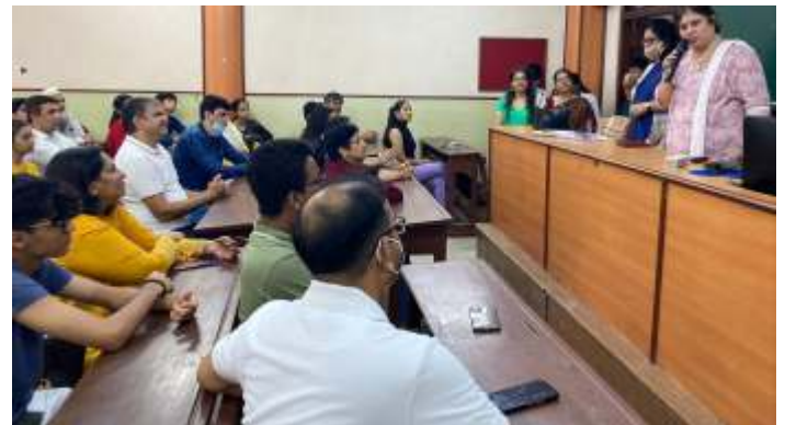
Principal’s interaction with parents & rewarding regular attending students