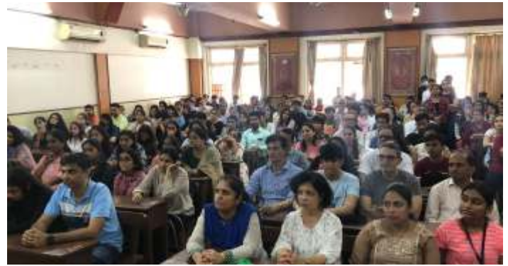
Principal addressing the parents of junior college

The WDC seeks to encourage girl students to work towards their personal and social development. The Cell aims in particular at sensitizing the student community to issues relating to the female gender. The role of the Cell is to equip the students with the requisite awareness and self confidence which in turn would allow them to take their rightful place in the society.