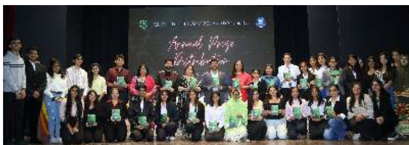
Jubilant students with their copies of the Anthology Volume 2

The club provides a challenging and inspiring platform for the youths to showcase and hone their writing talents.