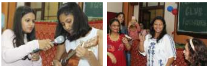
French National Day celebration

The French Club aims to encourage and enhance the linguistic skills of the students by creating a mélange between the love for France, the French language and the French Culture. The students come together and organize activities like French Fiesta, Amazing Race and French National Day.