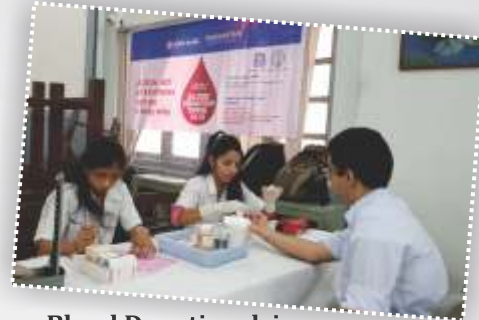
Blood Donation drive at HR College