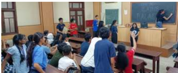
August 5, 2022 - Game Palacio - An event where all the participants inculcate knowledge of finance, business and economics.

The club aim is to impart knowledge of economics to the students while making them organize events where they learn about their responsibilities towards the club as well as the college. The motto of ECHR is 'making the students New Gen Economists'.