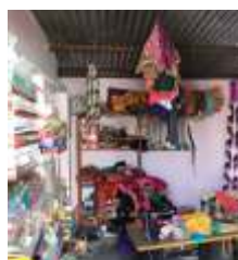
Students helped budding entrepreneurs to set up a beauty parlour cum tailoring shop in the village