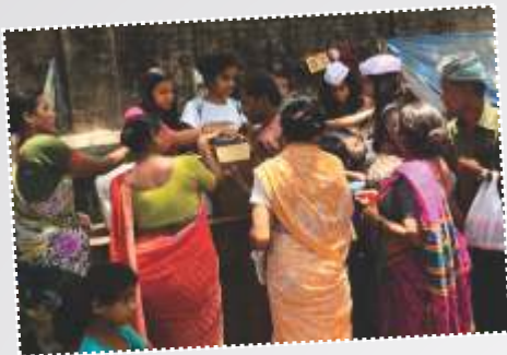
Project LUNCHBOX - millions fed nutritious food at railway stations and in slum areas.