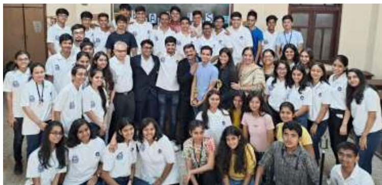
December 23, 2022 - Brand Plus - Core committee with the winners

The Club aims to develop business acumen among the students who are the budding entrepreneurs of tomorrow by organizing field trips and guest lectures by the experts in the field of business. The Club also organises Business Quiz and Debate on current topics in the field of trade, commerce and International Marketing, thereby, encouraging students to participate in Inter-collegiate business quiz competitions.