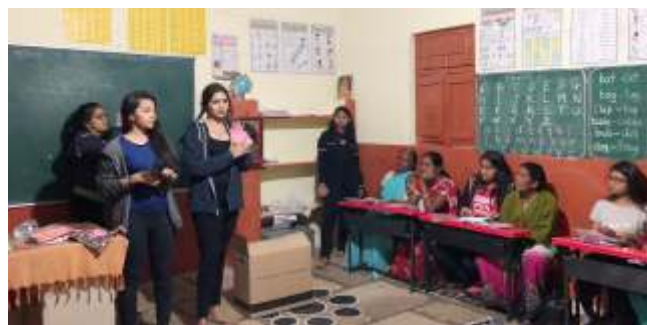
SANITATION - Teaching village women the basics of menstrual hygiene