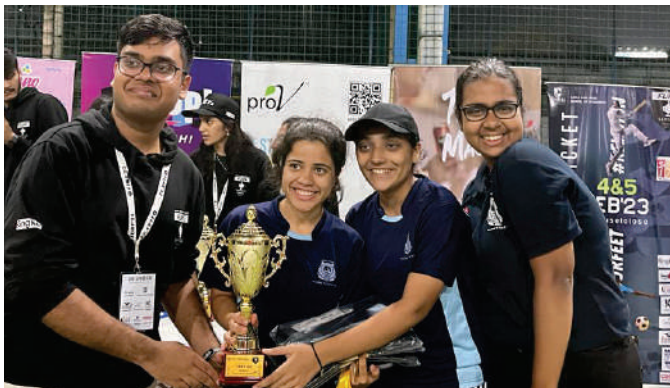
The Sports Council of H.R. College excels at Fury '23 with the Girls' Football Team clinching the First Place.