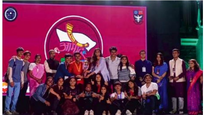
Overall Second Runner - Up

HR College of Commerce and Economics made a remarkable presence at Aamod 2024, a cultural extravaganza organized by St. Xavier's College. MVM emerged as the 2nd Runner Up in the overall rankings. HR College of Commerce and Economics emerged as the 2nd Runner Up in the overall rankings, a testament to the collective talent, dedication, and spirit of our participants. Aamod 2024 provided a platform for our students to shine, fostering cultural exchange and celebrating the vibrant diversity of talents.