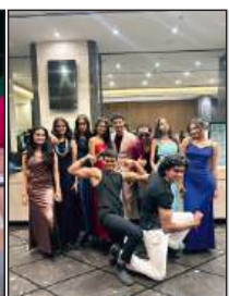
Our Fashion Show Team for Umang'23