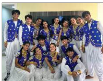
Dance Team for Umang'23

H.R. College of Commerce and Economics participated in Umang'23 - N.M. College's flagship intercollegiate fest. HR Contingent CC140 put up a marvellous show and emerged victorious with the Overall First Podium. Participants exhibited talent and dedication through their performances, leaving an indelible mark on the events. The performances ranged from dance routines and musical acts to theatrical presentations, reflecting the diverse talents and skills of the college's students. The main days of the event took place at the JVPD Grounds where participants performed in front of influential personalities. Apart from the Overall First Podium trophy, HR contingent managed to secure one departmental trophy for Informals and several other wins.