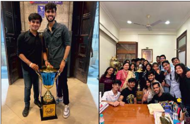
Sindhi Society Core with Principal