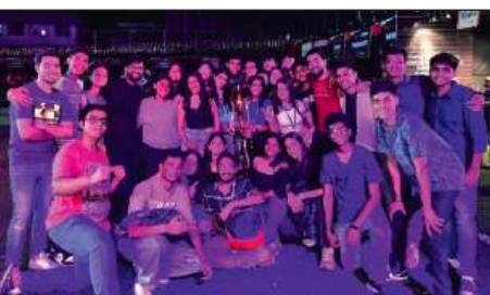
First Podium - The Cultural Committee at Umang'23