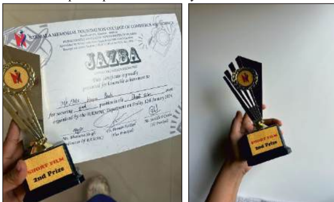
BAMMC Committee Achievements

The BAMMC Committee participated and bagged the 1st Runners up prize in the Jazba Inter-Collegiate Media Fest organized by Nirmala Memorial Foundation College. The whole team was awarded a trophy as well as certificates for their highly enthusiastic participation and victory.