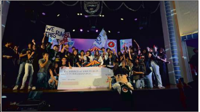
Core Team Receiving Cash Prize