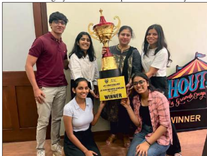
Team Celebrating after Winning the 1st Podium in Business Conclave

Happy to share that the Investment Club of H.R. College (ICHR) secured 1st Podium at Jai Hind College's Business Conclave. Investment Club of HR College has participated in the Business Conclave at Jai Hind College. Business Conclave – Jai Hind College's Newest event, a BBA initiative; is an immersive experience, a pure amalgamation of competitions, events, workshops, and activities that encompasses all focus areas imaginable, within the numerous domains of corporate culture. There were 10 events in total and HR College had 25 participants for the events. Winning podiums in almost all the events ICHR continued its legacy and secured 1st podium overall this year.