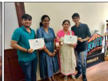
Participants with the Principal