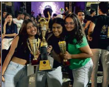
CL with ACL's of Malhar 2023