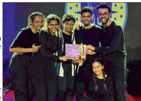
Polaris - Inter Win - First Prize - Dance Event

Along with these prizes, a performer from the contingent bagged the best male dancer award. The scholarships for dance workshops were also awarded to the winners of the dance event.