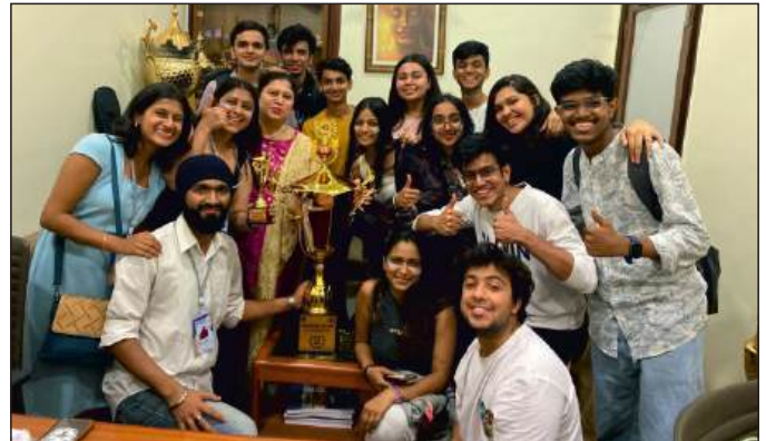
BAMMC Core with Principal

The BAMMC Committee participated and bagged the 2nd Runners Up prize in the Detour Inter-Collegiate Media Fest organized by the media department of Jai Hind College. The BAMMC Committee Represented H.R College in this competition.