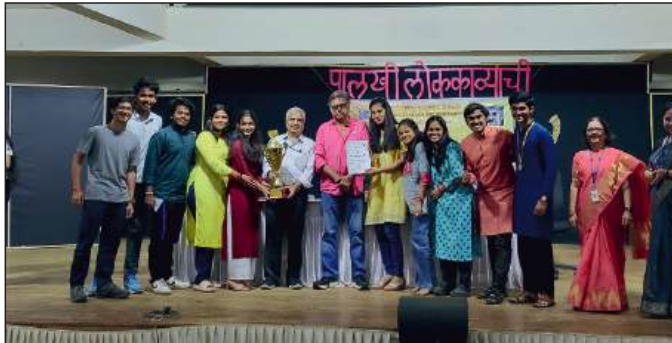
Team MVM - H.R. College

Marathi Vandgmay Mandal (MVM) participated in Varasa 2024, a cultural fest organized by D. G. Ruparel College which was held on 23rd and 24th of January 2024. MVM club had put in immense efforts and practice to participate in the events conducted by them. The club participated in various departmental events such as literary, fine arts and performing arts. After great team spirit, endless efforts and tough competition they won the overall 1st Podium and were crowned as the BEST COLLEGE in the competition.