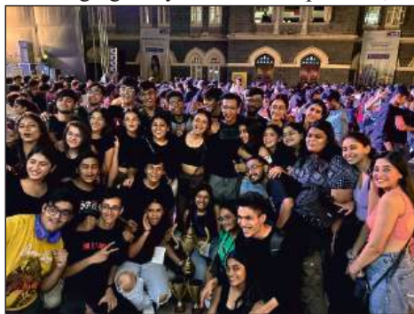
Participants after the Glorious Victory