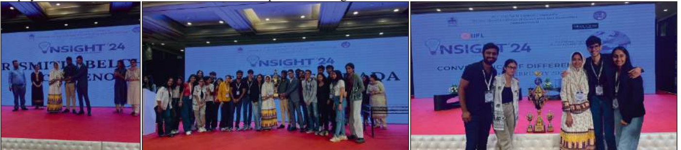
CL & ACLs with the Secretaries with the Trophy

The Students' Council represented their institution at Insight, an Inter-Collegiate Business, Finance and Economics Fest hosted by Narsee Monjee College. Demonstrating excellence, The Students' Council not only clinched the Overall PR Trophy and the Best CL Trophy but also achieved a commendable Overall 1st podium at Insight 2024.