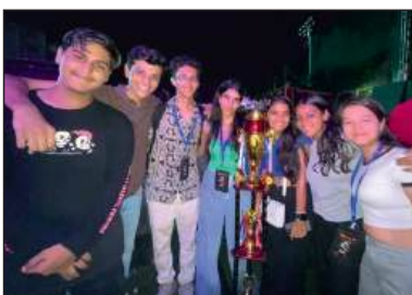
Director, CL & ACL's of Umang