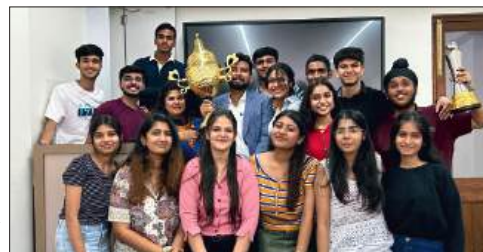
Be a Banker Fest

The Banking and Insurance Committee participated in Be A Banker Fest, a national-level competition hosted by Thakur College, representing HR College. H.R. College secured the Overall 2nd Runner Up Podium, competing with esteemed colleges from across India.