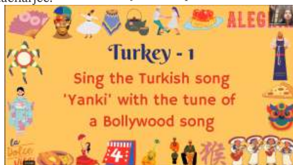
Cultural jamboree Zipcode