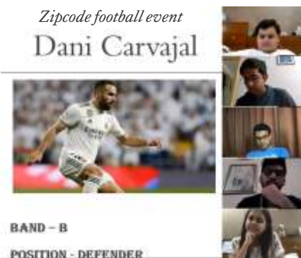
BAND - B POSITION - DEFENDER