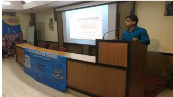
The team operated under the guidance of field coordinator

Students are awarded additional 10 marks to their overall semester score/GPA when they enrol into DLLE as upon completing a certain number of allotted hours of extension work, both - indoors and outdoors. Students of HR College were required to complete a total of 120 hours in order to receive the benefit.