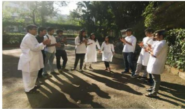
University of Mumbai's annual festival Udaan