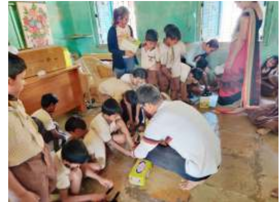
Finding the right size