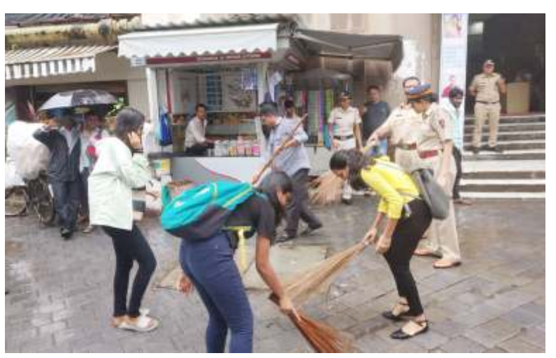
Students and Mumbai Police clean area near Churchgate subway

The NSS unit of H.R. College in collaboration with Mumbai Police conducted a cleanliness drive outside the Churchgate station subway to support Swachh Bharat Abhiyaan. The NSS volunteers and Mumbai Police selflessly cleaned the area to spread awareness and importance of hygiene in society.