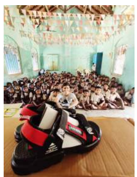
The pair of sandals donated to the children

The volunteers of HRNSS crowd funded 174 pairs of footwear and donated them to the underprivileged students of the municipal primary school at Gorhe, Palghar. This initiative was well praised by the principal and teaching staff of the school as well as the villagers.