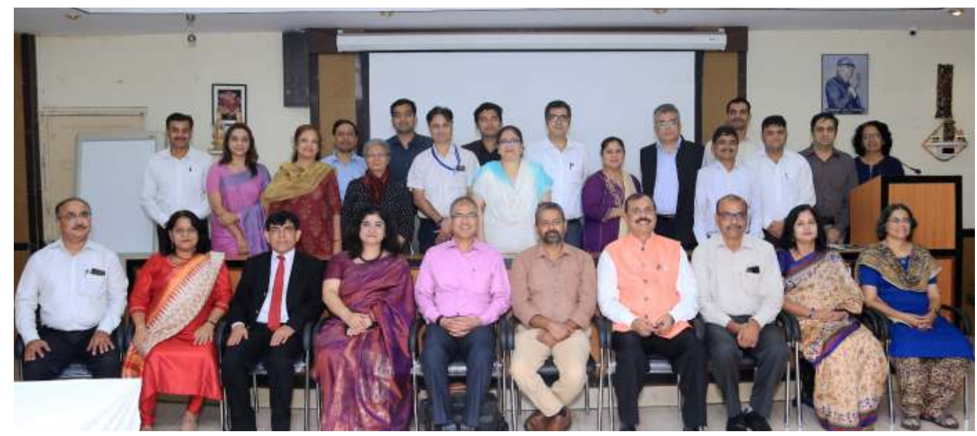
Officials from the Ministry of Ayush and the HSNC Board, along with Principals of the HSNC Board Institutions