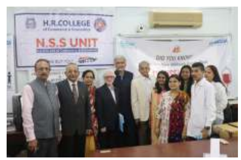
Team from TransAsia Bio-Medicals