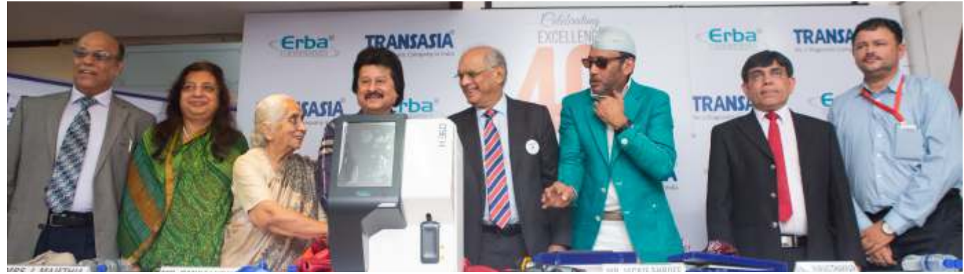
TransAsia donated a sophisticated ERBA fully automated haematology analyser to PATUT and sponsored the blood tests done