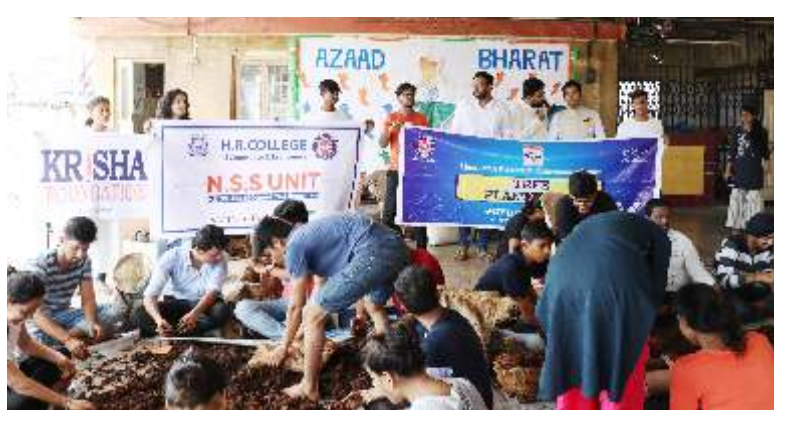
Preparation of seed bombs in full swing