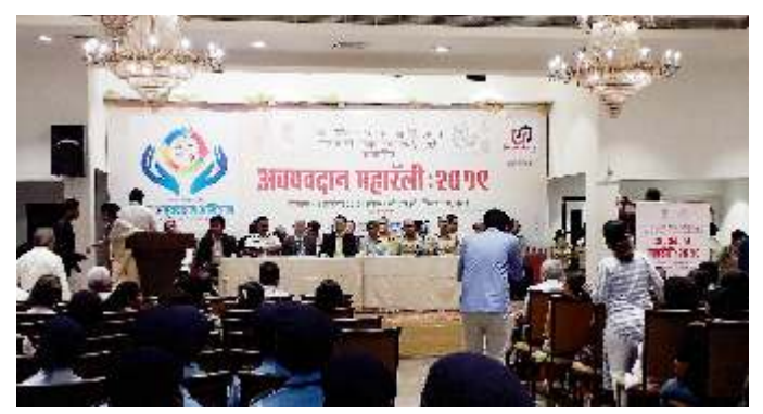
Dignitaries present for the organ donation pledge