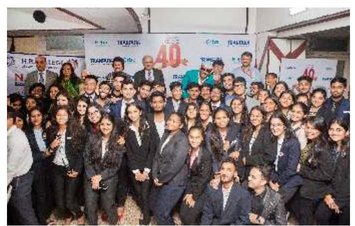
With NSS volunteers - organisers of the event