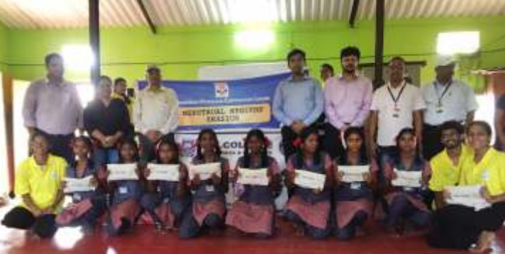
Menstrual kits sponsored by HPCL, were distributed to the girls of the municipal school at Gorhe, after the seminar.