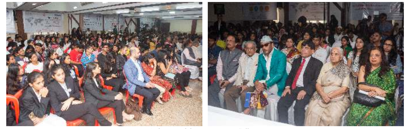
Audience and dignitaries at HR College