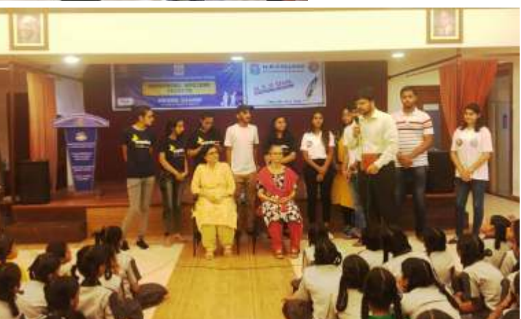
Seminar at VBM and MSPT Schools