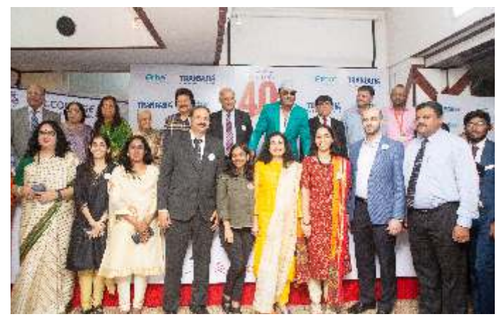
Officials of TransAsia Bio-Medicals and other guests