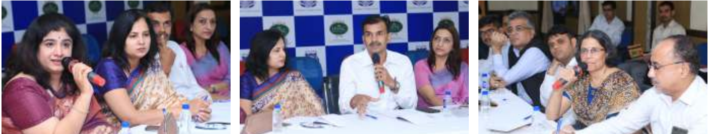
Deliberations by Principals on promotion of yoga amongst the youth

In the session, along with the benefits of yoga, a plan on how to promote yoga in youth was drafted. The dedicated NSS volunteers were responsible for the smooth functioning of the event as well.