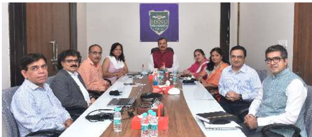
Customary meeting, prior to the First General Council meeting of the Vice-Chancellor with Officers at the HSNC University, Mumbai Headquarters, on 13th March 2021.