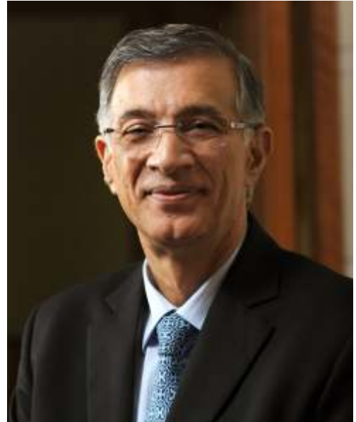
Dr. Niranjan Hiranandani