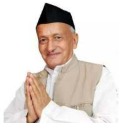
Shri Bhagat Singh Koshyari

Shri Bhagat Singh Koshyari took oath as the 19th Governor of Maharashtra on 5th September 2019. At a public function in Mumbai, the Hon'ble Prime Minister of India Shri Narendra Modi publicly acknowledged that he had the